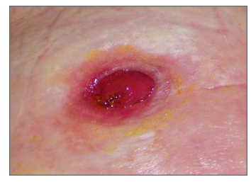
Off Centered Stoma Opening