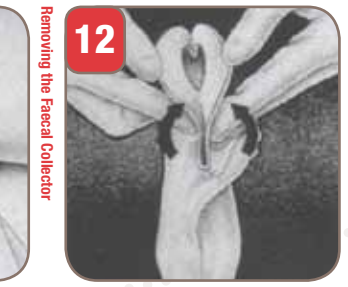
Seal the collector by folding skin barrier in half so it adheres to itself. Kindly follow your hospital/local policy/infection control policy guidelines for disposing the faecal collector. Do not flush down the toilet.

Hollister and logo, Hollister, Flextend and SoftFlex are trademarks of Hollister Incorporated. © 2011 Hollister Incorporated. CC0152