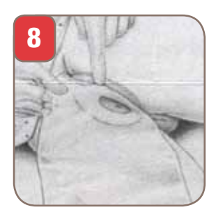
Remove the remaining piece of release paper (numbered 3 or 4) and place the skin barrier against the skin. Be sure the barrier adheres firmly to the skin at all points.

Remove the release paper from the portion of the skin barrier nearest the patient's lower buttock (numbered 3 or 4, depending on the patient's position). Press the barrier firmly against the skin.