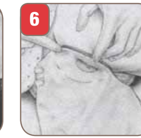
Place the upper portion of the exposed skin barrier (numbered 2) against the coccygeal 1) area and press firmly against the skin. Release m. the buttocks, allowing them to assume a relaxed oosition.