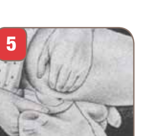
Press the barrier firmly against the skin to ensure a secure bond. For male patients adhere this section of the barrier (numbered 1) to the skin between the anus and the scrotum.

Have the patient assume a side-lying position with the upper knee toward the chest to expose the perianal area. The patient should remain in this position for the entire application procedure. Remove the collector and discard the plastic cover which protects the skin barrier. Close the cap on the convenience drain.