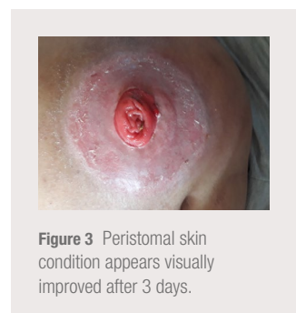
Figure 3 Peristomal skin condition appears visually improved after 3 days.