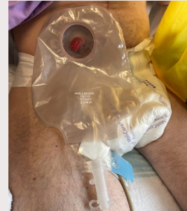
Figure 3 Thick discharge from his ileostomy.

Lastly however, was the consideration of his pouch. With high volumes of output that was essentially all liquid, he required a high output pouch. (See Figure 3) This enabled the capture of excessive fluid for short periods, for example walking, and the easy connection to a secondary collection system for drainage. (See Figure 4) This new system was easy for both ward staff and patient management throughout his readmission. The plan was to have his colorectal assessment and early stoma reversal.