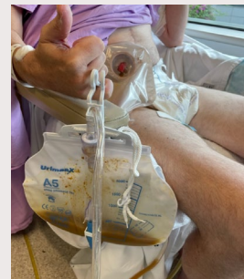
Figure 4 Two-piece soft convex skin barrier in place. Not well-protruding stoma.